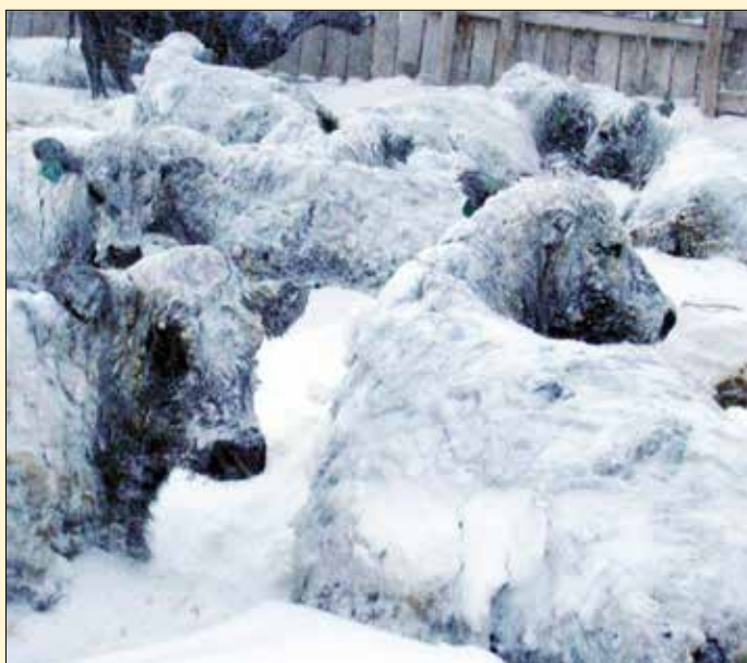
The livestock industry should not be rewarded for allowing cows to freeze in the snow.

Under USDA's Livestock Indemnity Program (LIP), when farm animals die in inclement weather — including hurricanes, floods, blizzards, hail, extreme heat, and extreme cold — farmers and ranchers are rewarded with a government check. In other words, producers, who paid no insurance premiums and, in many cases, failed to protect animals from harsh weather, are awarded our tax dollars for the deceased animals.