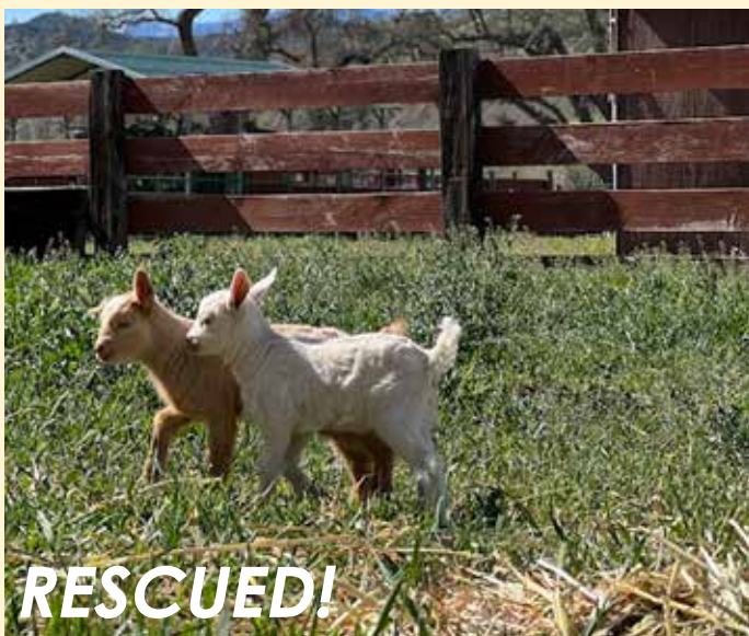
HFA's Suwanna Ranch provides over 7,000 acres of protected habitat for animals seized in cruelty cases. Your support saves lives!